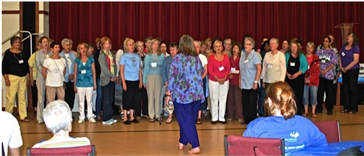
4th Great Lakes Regional Gathering

days or more. A key element of these events would be to foster improved skill-sets that would serve members in this work. As a result, twice as many Regionals were planned in 2019 than in 2018, with several hosted by chapters collaborating with other chapters in the region.