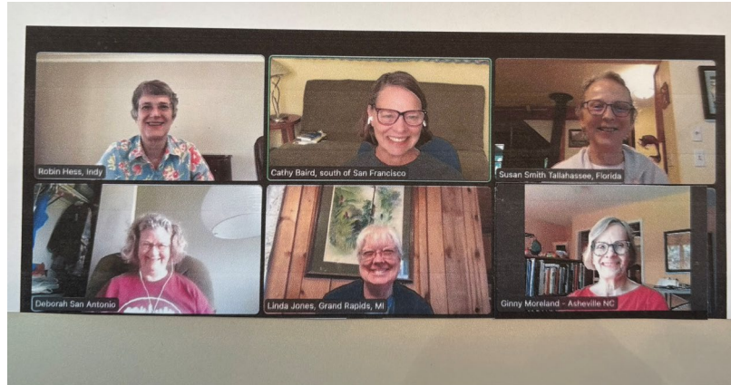
Current Coaching team