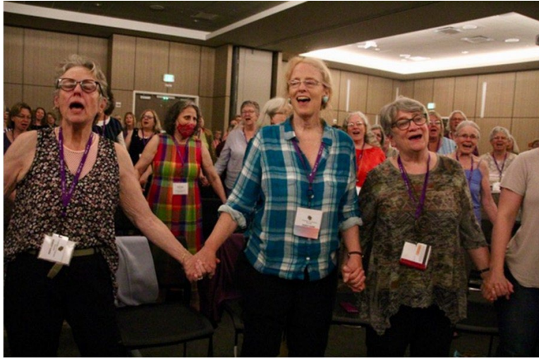
Attendees of the Elevate All Choir Gathering (Boulder, CO 2018)

heart." No one could have predicted that the glorious Boulder, Colorado ACG would be the last (the last to date, that is)